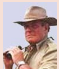
Col John Blashford-Snell